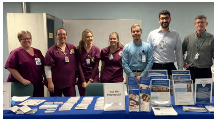
A team of nursing students, pharmacists and physical therapists were among the employees who staffed more than 60 health fairs throughout our communities.