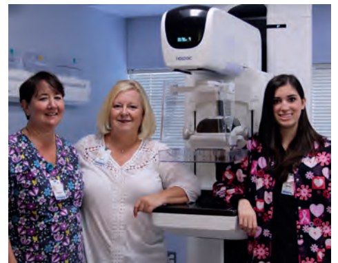
Hallmark Health certified mammographers are specially trained in the latest imaging technology to better detect breast cancer.