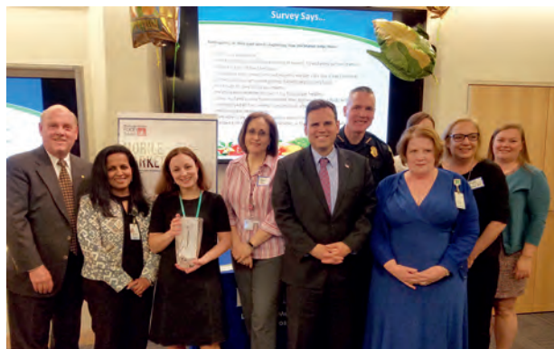
Jackson Healthcare presented a Program of Excellence Award to the Mobile Food Market team at a celebration with local dignitaries and community partners.